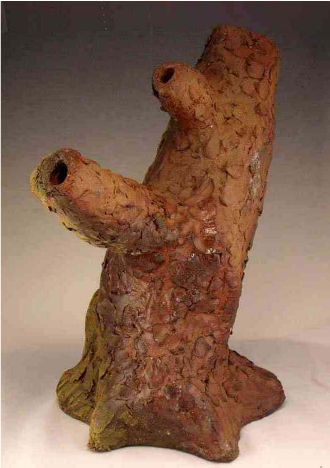
Tree Stump Vase, 2005 (13 ¼ inches H) Wood-Fired Stoneware