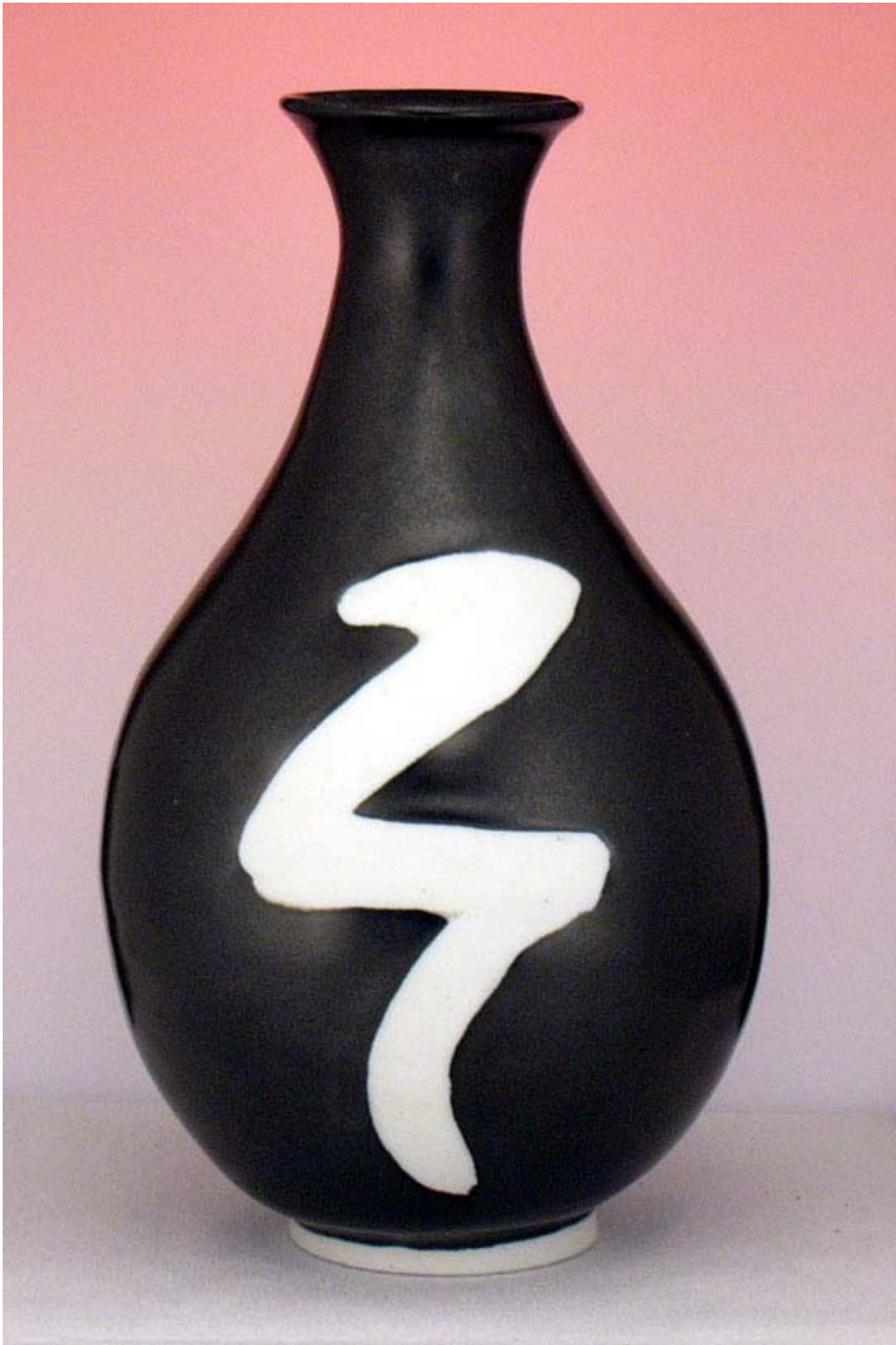
Bottle Vase, 2006 (9 1/8 inches H) Porcelain with Wax Resist Decoration and Gas-Kiln Glaze