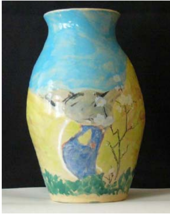
Vase, 2002 (7 5 / 8 inches H) Stoneware with Underglaze, Overglaze, Decal and Luster