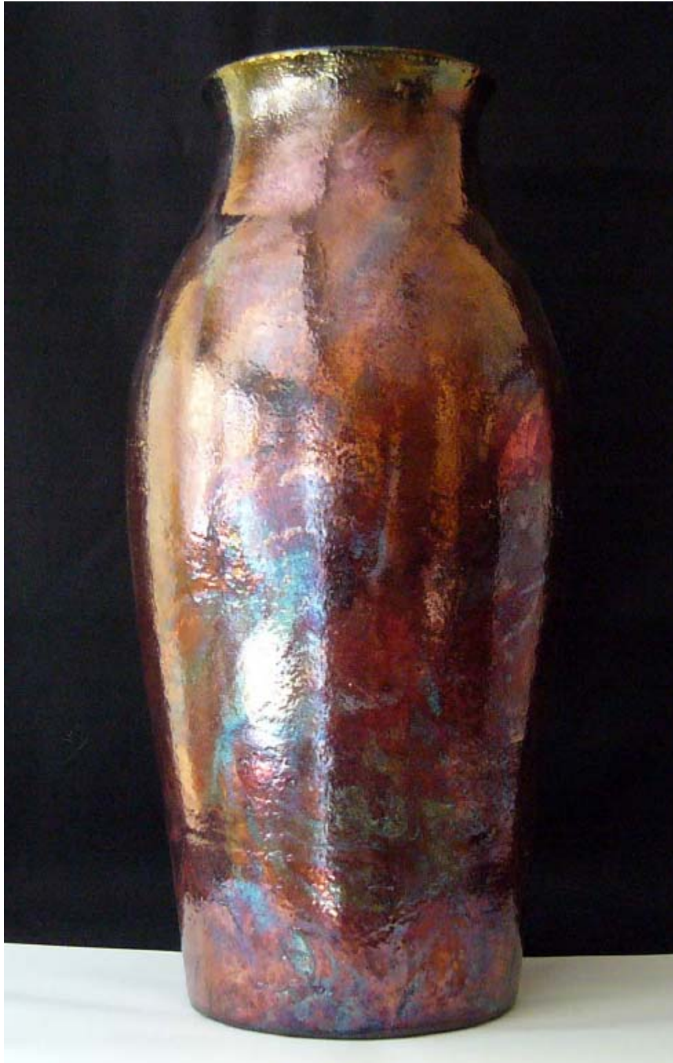
Raku Vase, 2003 (14 ¼ inches H) Luster glaze with Silver Stain and Post-Firing Reduction