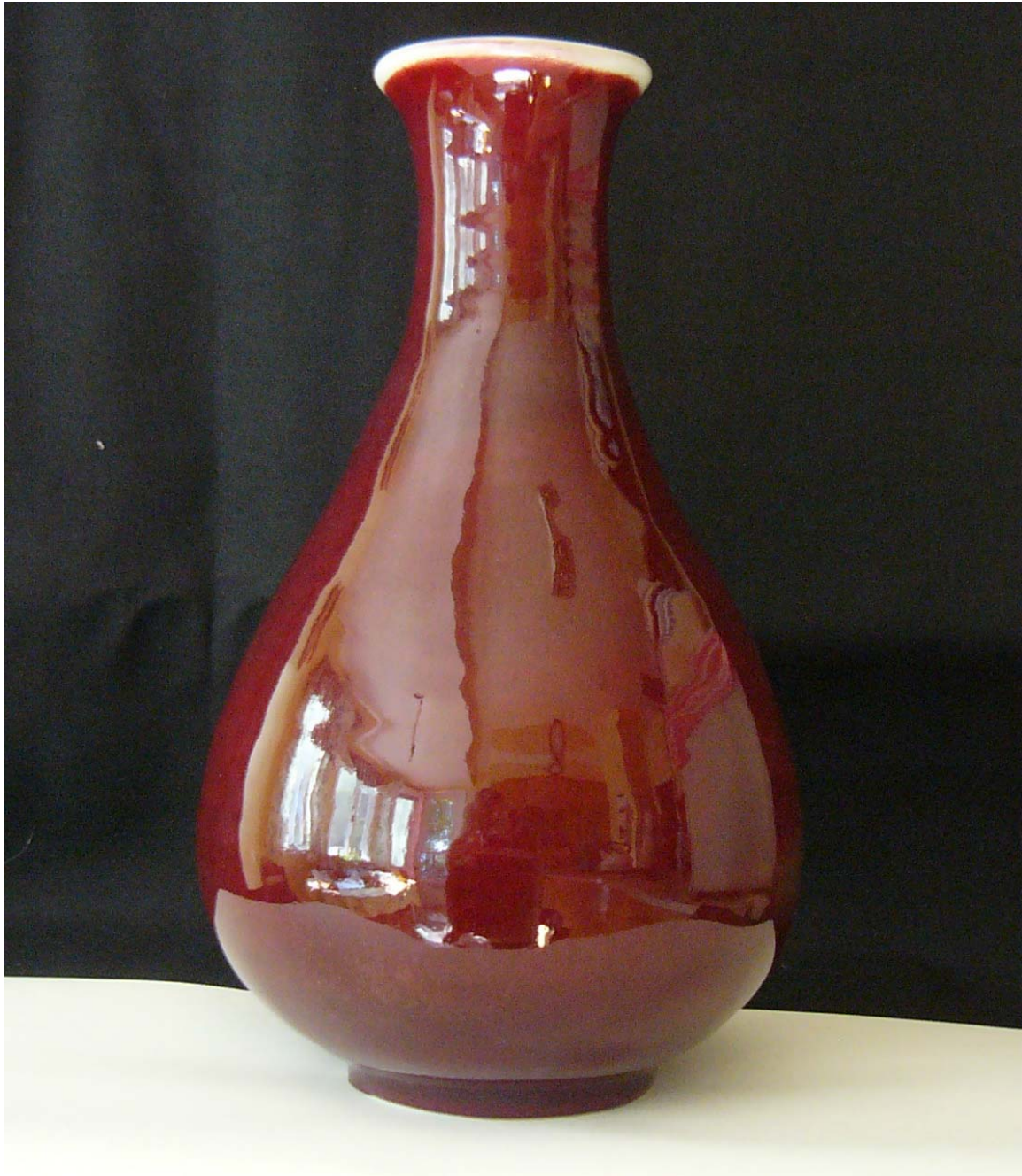
Bottle Vase, 2004 (9 1/2 inches H) Porcelain with Copper-Red Gas-Kiln Glaze