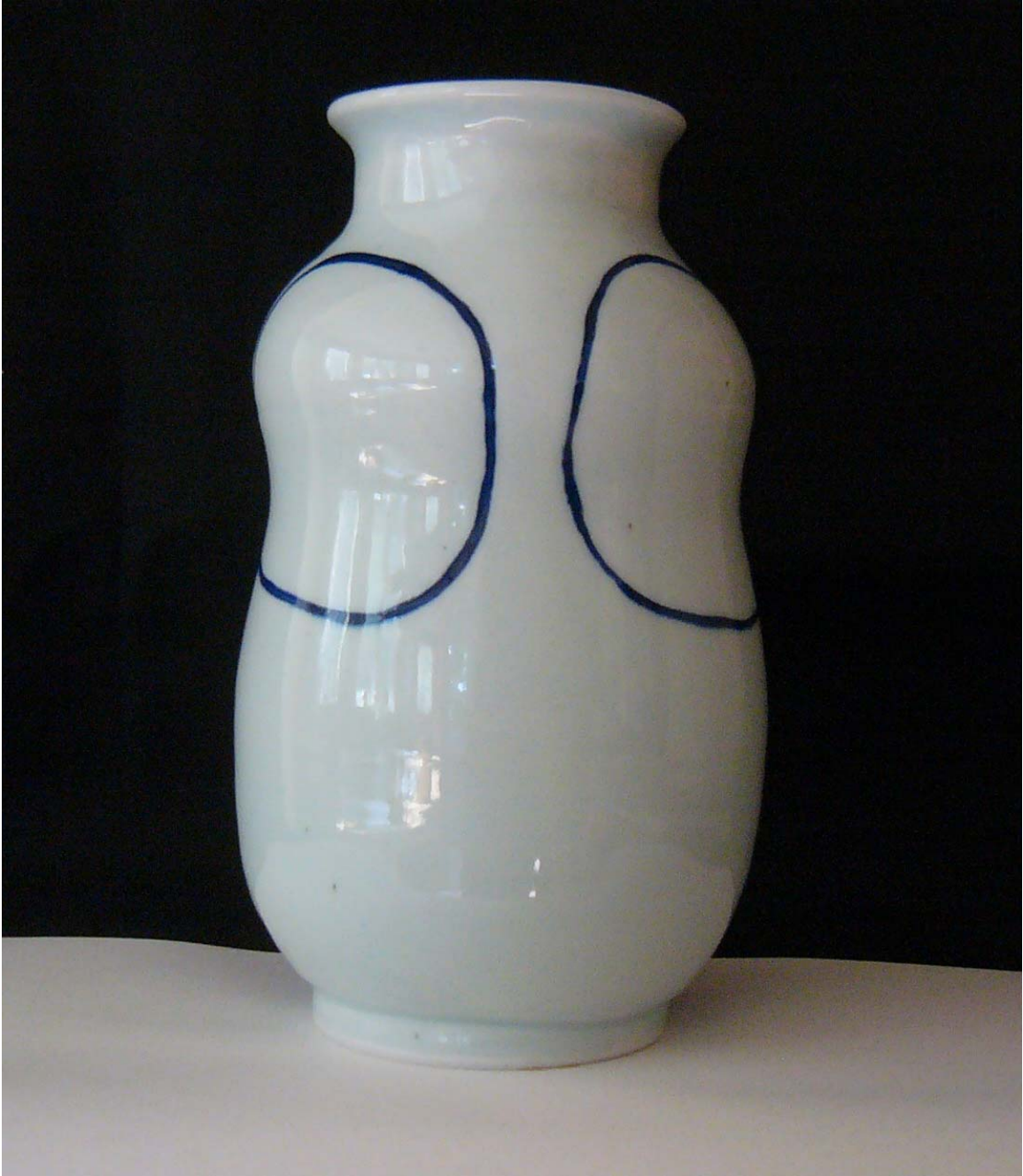
Gourd Vase, 2003 (8 1 / 8 inches H) Porcelain with Engobe Inlay and Celadon Gas-Kiln Glaze