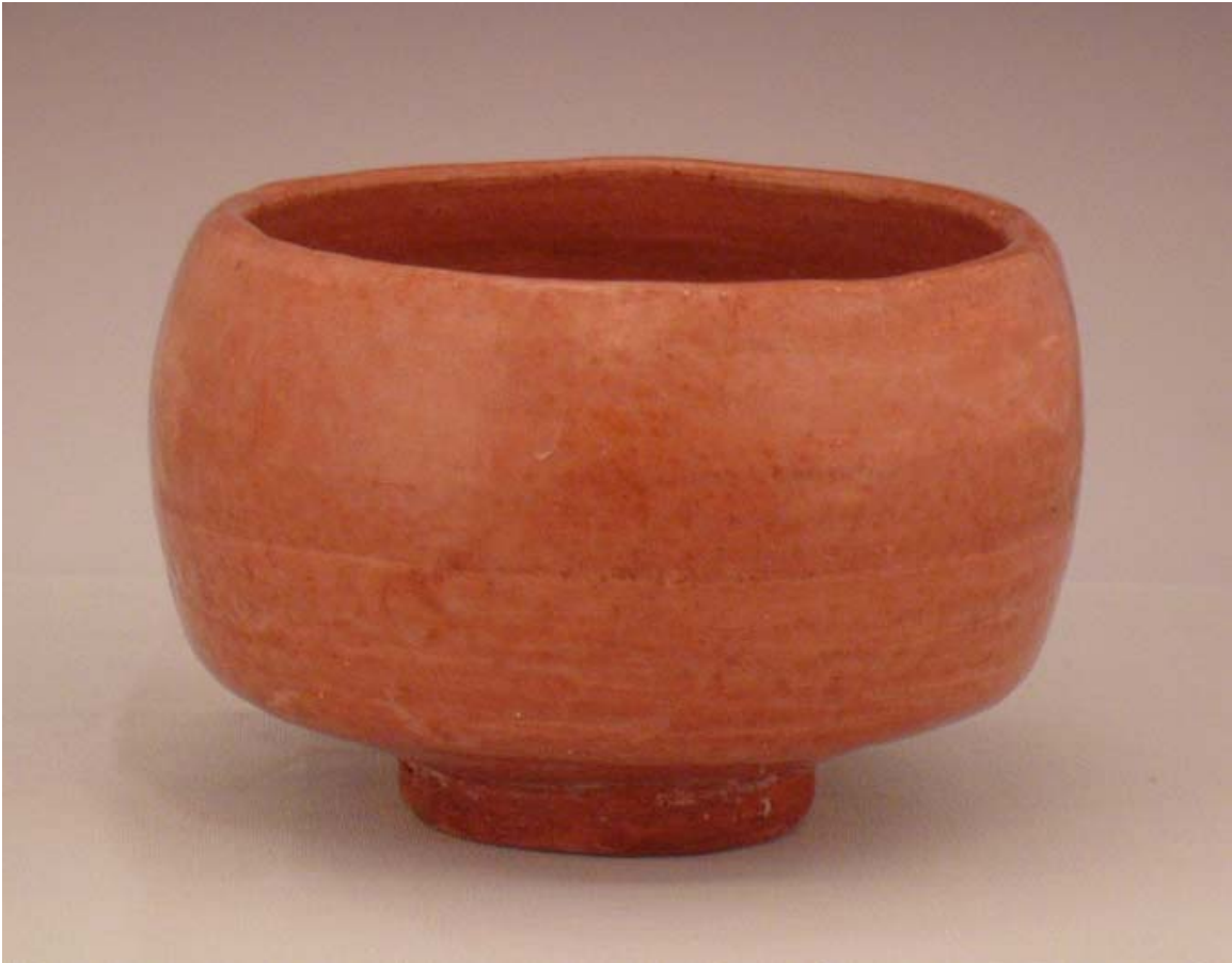
Red Raku Tea Bowl, 2006 (5-inches D, 3 ¼ -inches H)