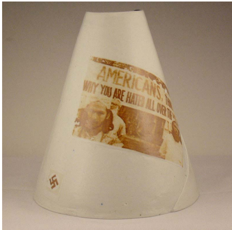
Hat(e), 2004 (7 5/8" H) Porcelain with Decal and Gas Kiln Glazes