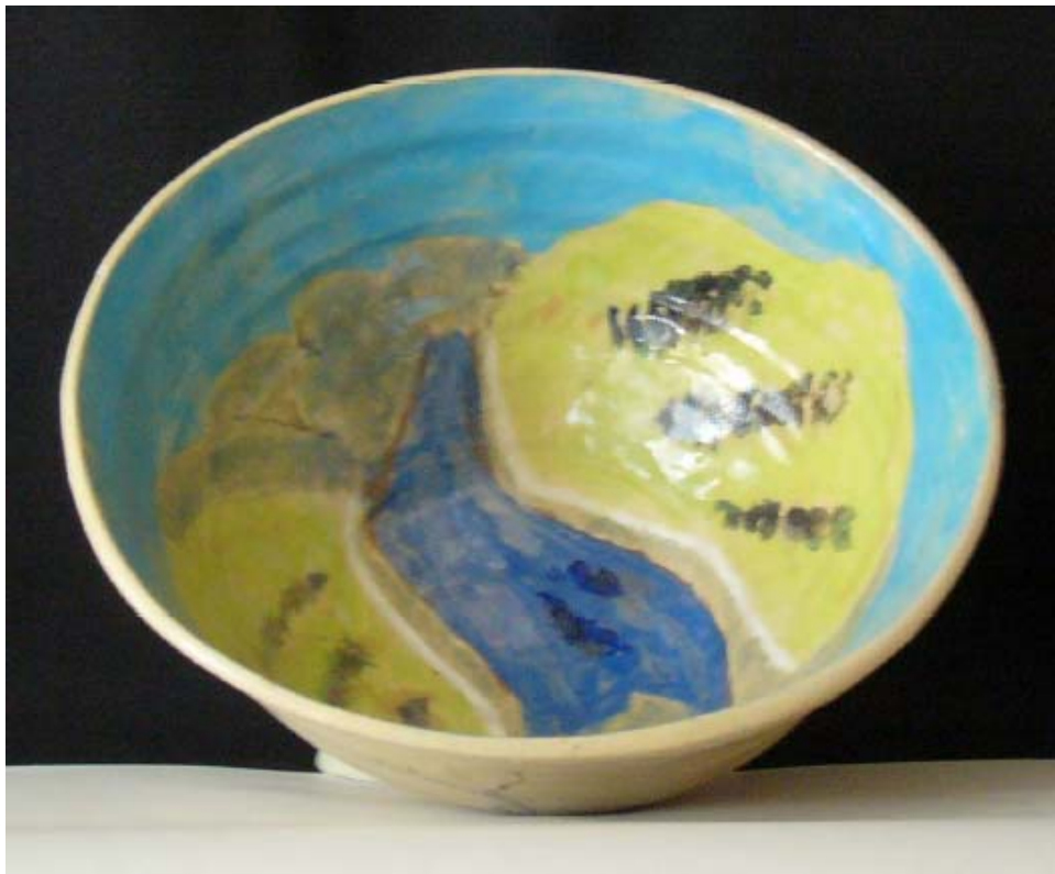
Bowl, 2002 (7 1 / 2 inches D, 3 1 / 4 inches H) Stoneware with Underglaze, Overglaze, Decal and Luster