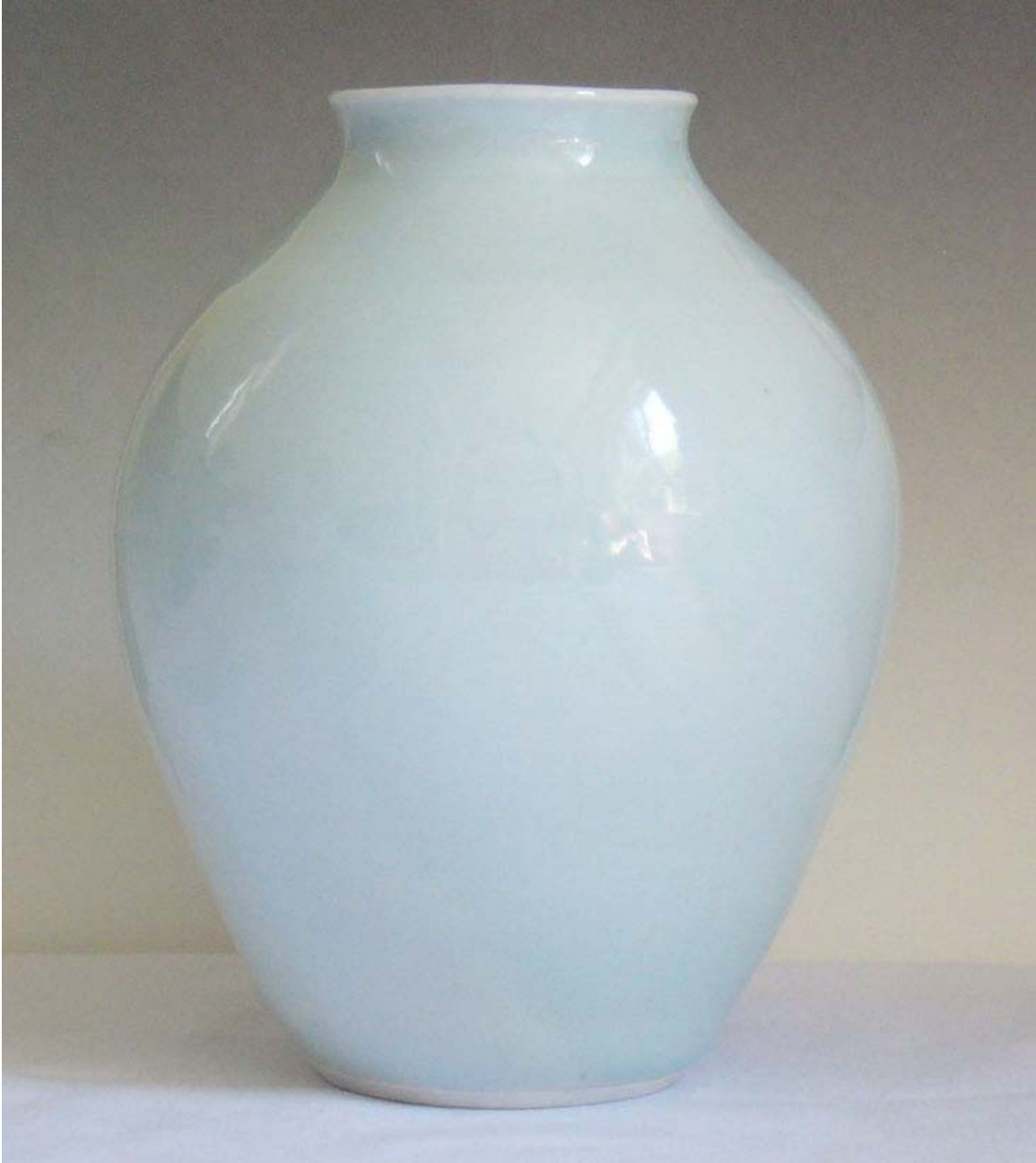
Wide Vase, 2005 (9 inches H) Porcelain with Celadon Gas-Kiln Glaze