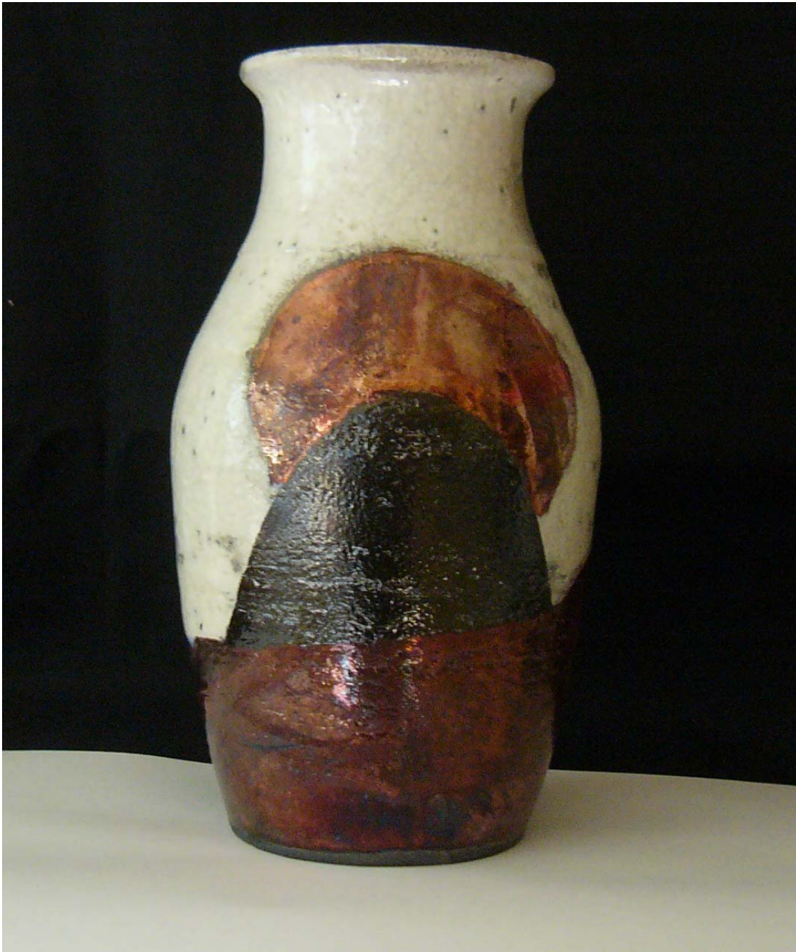
Vase, 2004 (8 ½ inches H) Raku with Silver Stain and Post-Firing Reduction