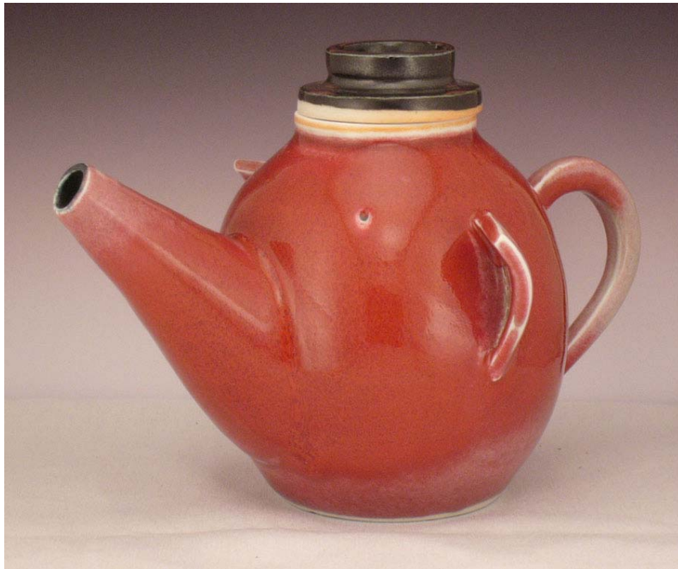
Tea Pot 2006 (6 1/8 inches H) Porcelain, Gas-kiln Glazes