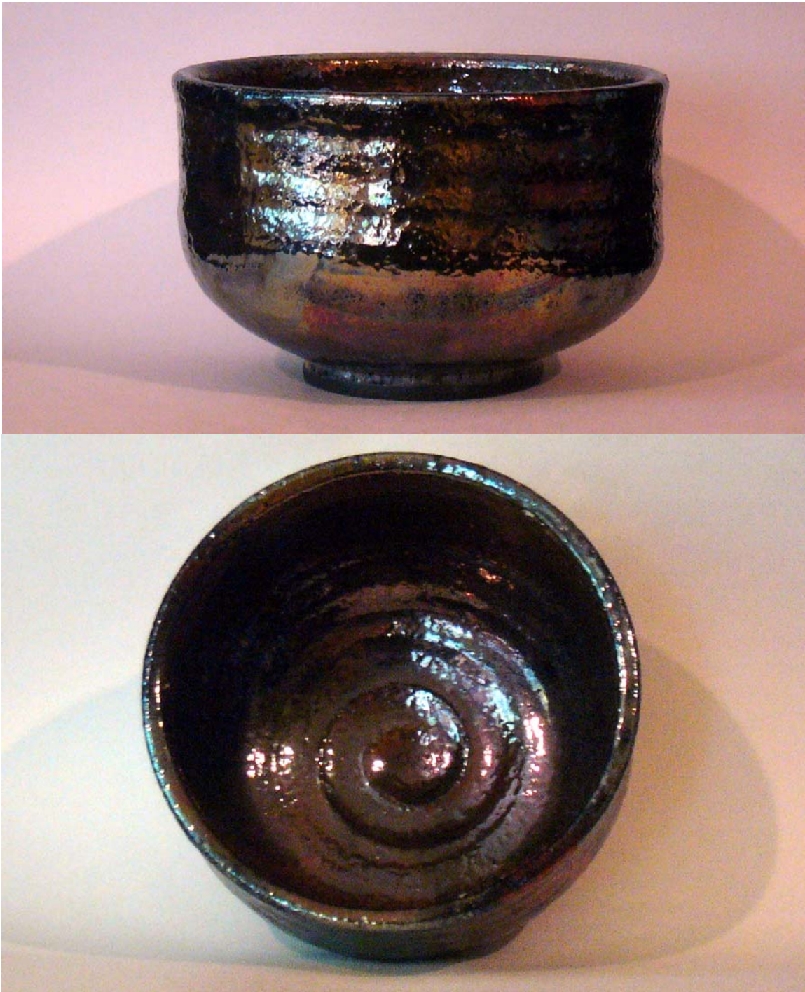
Raku Tea Bowl, 2004 (4 7 / 8 -inches D, 2 3 / 4 -inches H) Luster glaze with Silver Stain and Post-Firing Reduction