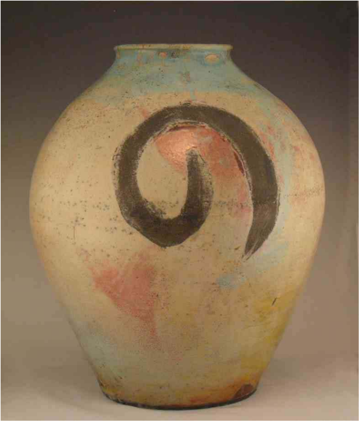
Tsubo, 2004 (11 3 / 4 inches H) Raku with post-firing reduction