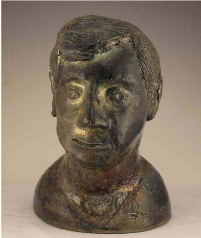
Self portrait 2001 (9 ¾" H) Raku with glaze, silver stain and post firing reduction